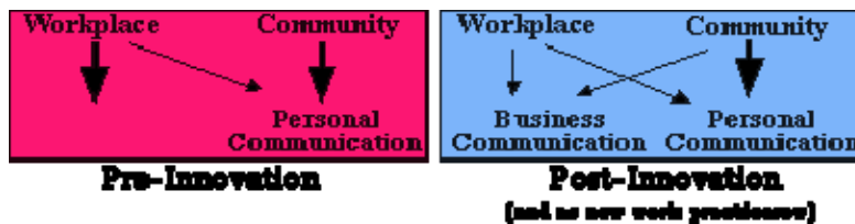
Potential evolution of business and personal communication.

It is possible, for instance, that workers may seek more contact with local businesses for expertise they need (i.e., office-related services such as copying, mailing, videoconferencing). "Smart" communities may even begin to plan for these formal and informal services, providing everything from computer support to professional support groups. Thus the move toward mobile work may revitalize some communities and spur them to develop new businesses and services designed to support mobile workers.